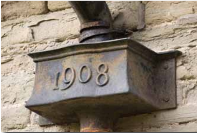
Evidence of the work carried out in 1908