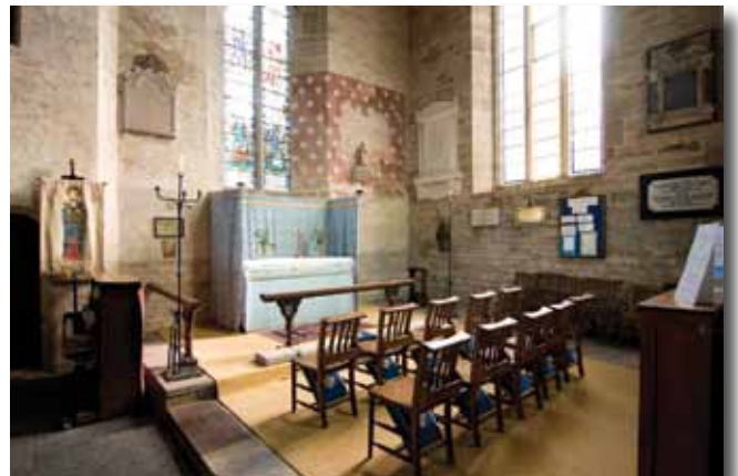
The Lady Chapel