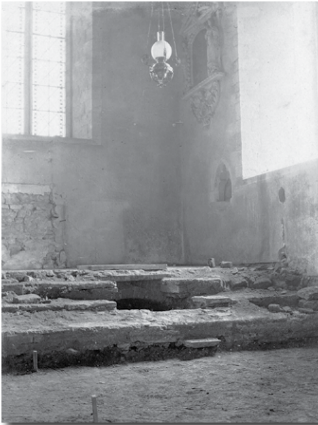
The last major work on the church was carried out in 1908/9