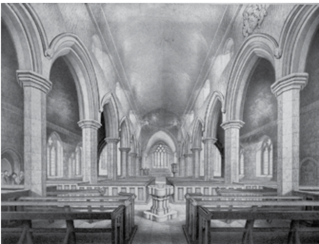
Copy of engraving dated Oct 5th, 1843 in the vestry showing the church as it was with pews