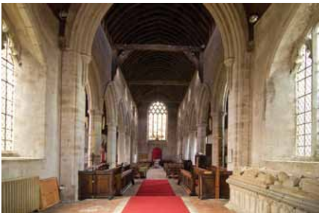
The Vicar's View!