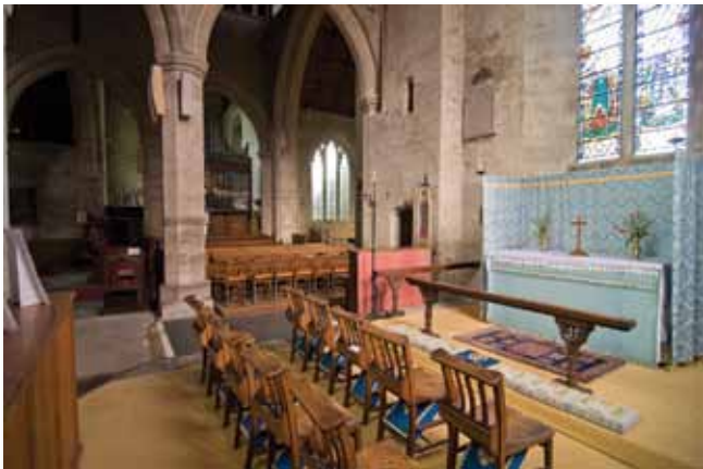
The "Lady Chapel" and beyond the organ and chancel

We feel that now is the right time to be looking again at the building.