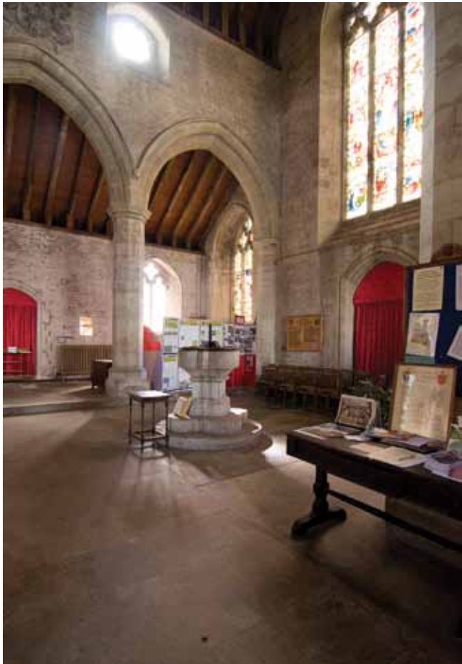
View of the font as you enter the church

There will be a Q&A session after each presentation when people will have the chance to raise questions with the speakers. Refreshments will be available during the day.