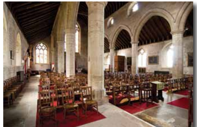
View from the Lady Chapel

We thank you for taking part and for your contribution.