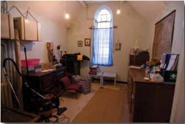
The Vicar's Vestry