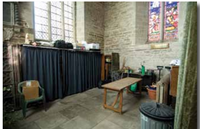
The "Flower Vestry" behind the organ