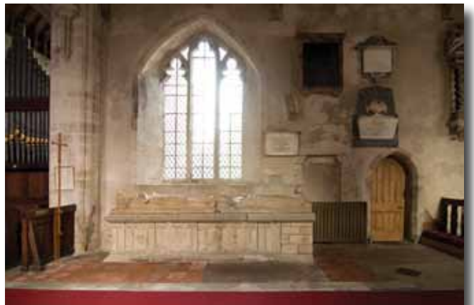
View of the Chancel facing north