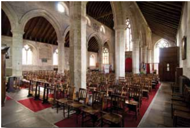
View from the Flower Vestry door to the west

The last time that anything major was done to the church building was in 1908 when the pews were removed.