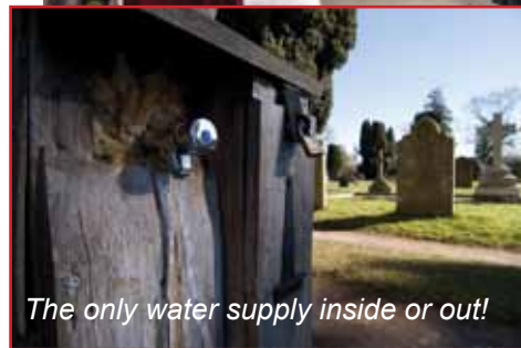
The only water supply inside or out!